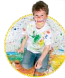
Paint messes of all kinds