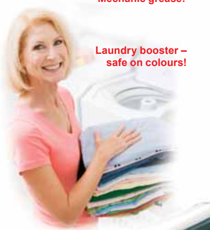
Laundry booster – safe on colours!