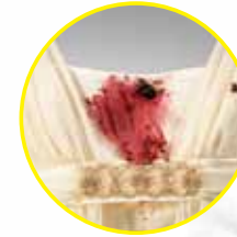
Food stains – even berry stains!