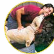
Safe around pets – even de-skunking dogs!