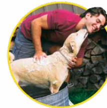
Safe around pets – even de-skunking dogs!