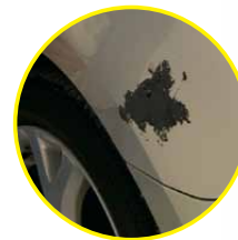
Oily, greasy, gunk of all kinds

A breakthrough in cleaning convenience – so versatile and yet so gentle.