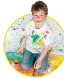
Paint messes of all kinds