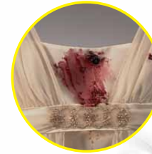
Food stains – even berry stains!