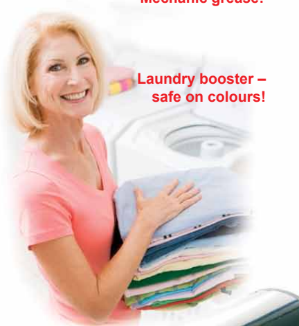
Laundry booster – safe on colours!