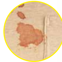
Blood stains and sickness messes