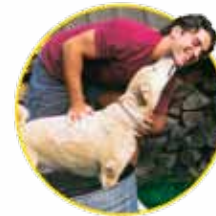
Safe around pets – even de-skunking dogs!